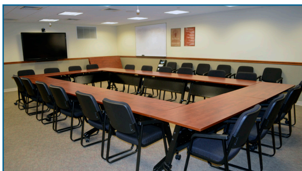
The Training Room

The Wellness Center at our Cimarron Road building serves as a fitness center and resource area for general health and wellness. It is utilized daily by people served by SullivanArc and staff members after hours.