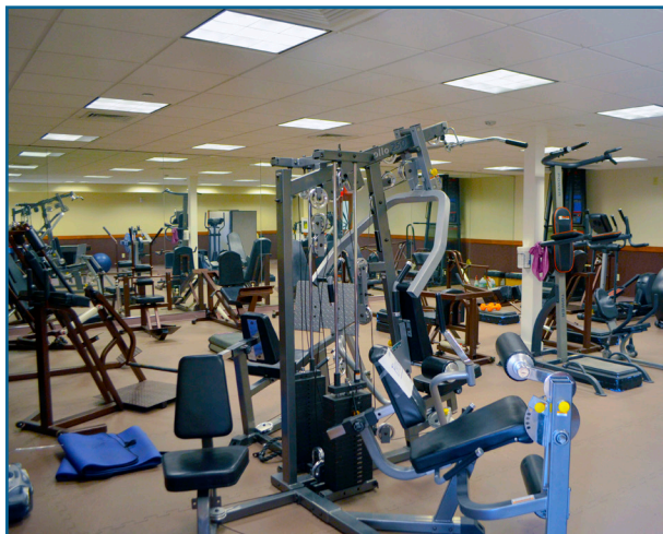
The Wellness Center