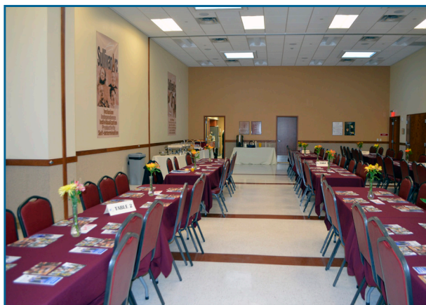
The Multi-Purpose Room